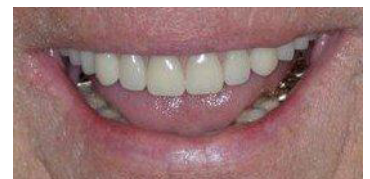
Restores smile and function