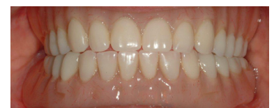
Restores smile and function

Uneven or excessive bite forces may cause premature wear of denture teeth. Denture teeth may fracture or become loose from the denture. The denture base can also fracture. Unmanaged bite issues can also cause implants to loosen within the bone and break. Broken or loose implants must be surgically removed.