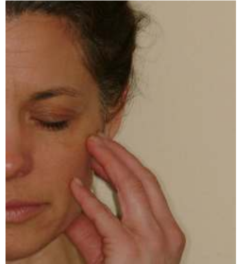
Facial, muscle or joint pain

Ignoring a jaw joint problem may lead to chronic, debilitating pain and an inability to function normally when chewing and speaking.